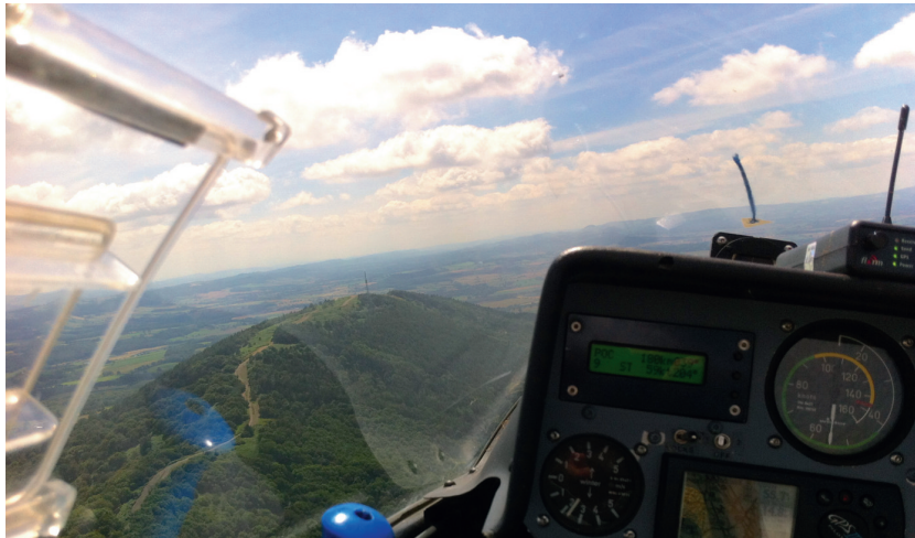
Right: Attempting to get away

The trip back is just as entertaining – trying to get upwind again in thermals leaves me talking to Shawbury on the radio and explaining that all is well despite my being less than 1000' above ground in a pure glider in the middle of the MATZ. 'Lots of fields here – don't worry,' I tell him cheerfully. Though I only feel truly cheerful