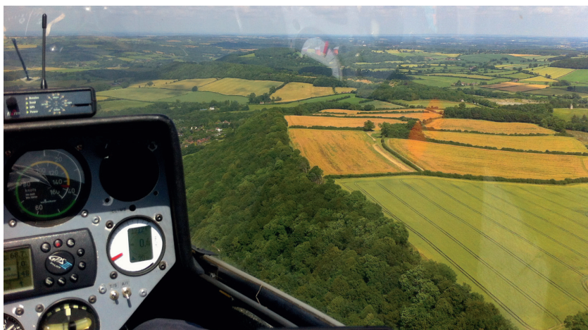
Below: End of a Wenlock run

when my mental arithmetic tells me I can make it back to Seighford in time for beer and the obligatory tall tales. What a great flight - it takes me quite some time to stop grinning after landing.